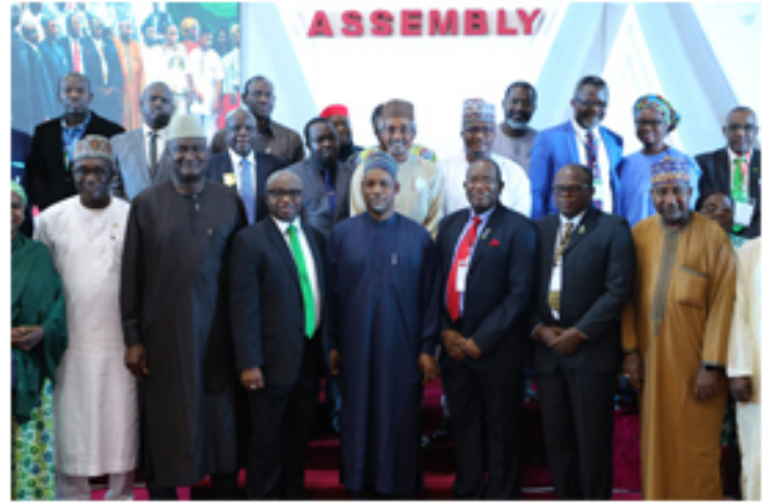
The President/Chairman of Council, the Vice President/Vice Chairman of Council, some Council members, the Registrar/Secretary to Council and Dignitaries and Invited Guest in a group photograph after the Assembly