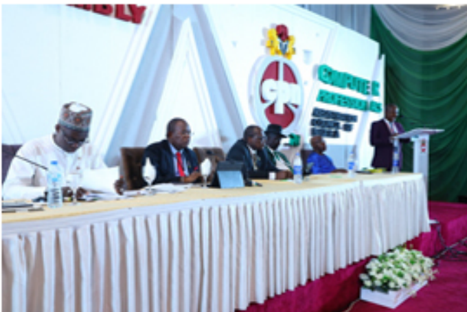
The 28th Annual General Meeting