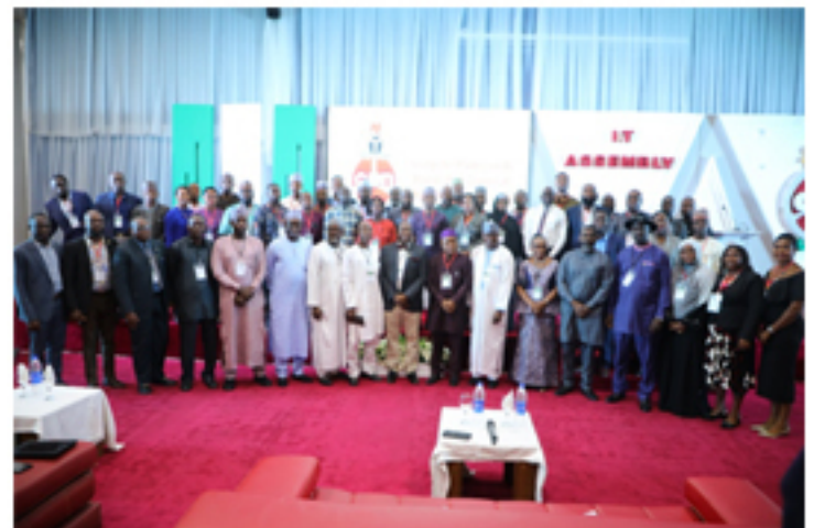
A Cross Section of Inductees taking turn to Take pictures with Council Members after the Induction Ceremony