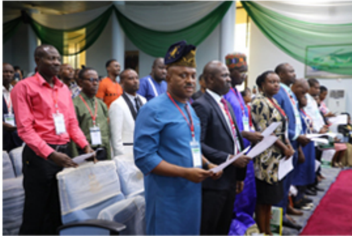
A cross section of Inductees taking their Oath of Allegiance during their Induction ceremony