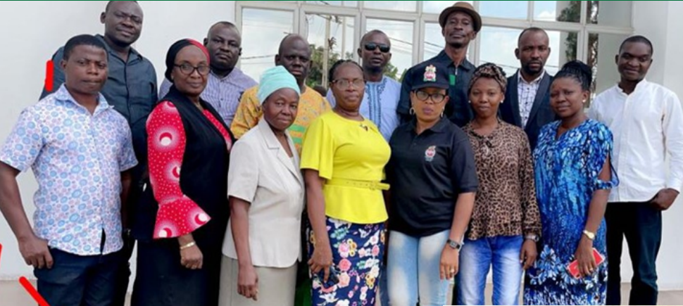
Participants at The Executive Registration Programme (ERP) Held In Ibadan, Oyo State