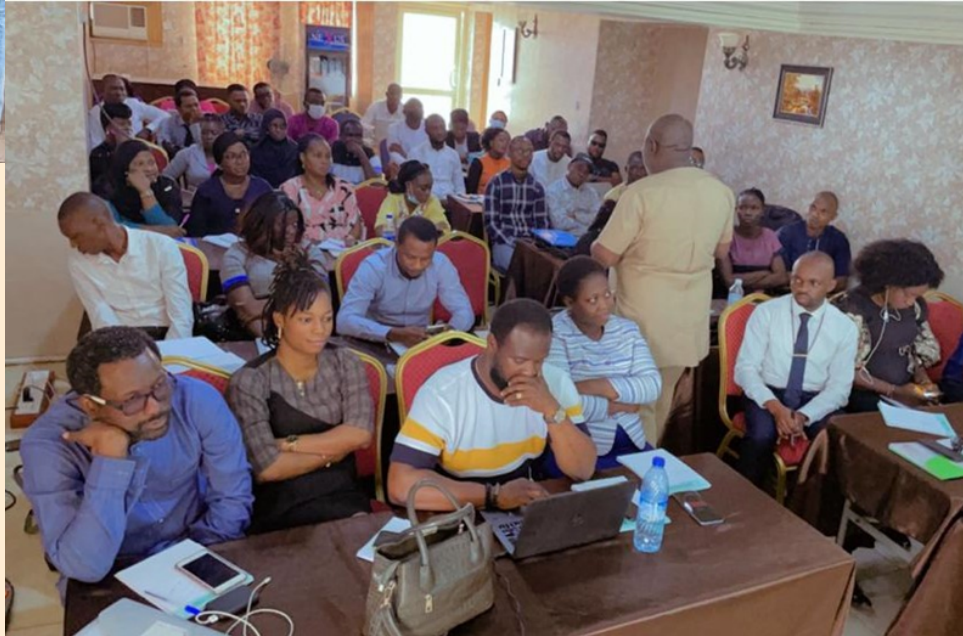
Participants at The Executive Registration Programme (ERP) Held In Abeokuta, Ogun State