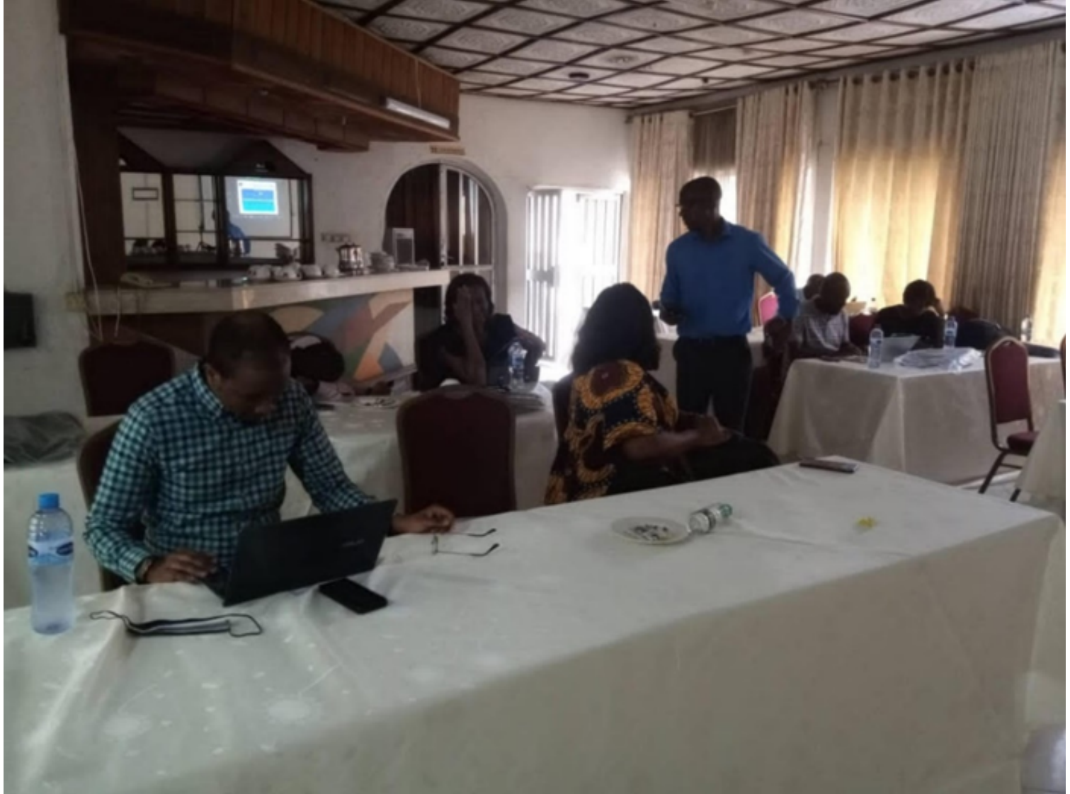
A Cross Section of Participants At The MCPD on Information Security Management System - Introduction to ISO 27001 which came up on Thursday 23rd of June, 2022 at the Lagos Airport Hotel, Obafemi Awolowo Way, Ikeja-Lagos